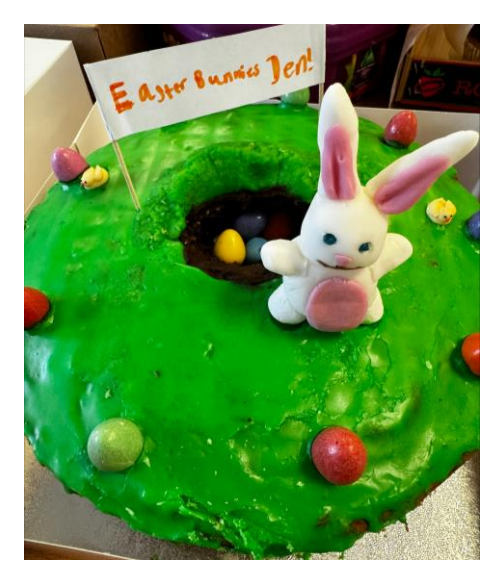
Freddie (year 5)