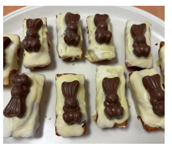
Imogen (year 6)